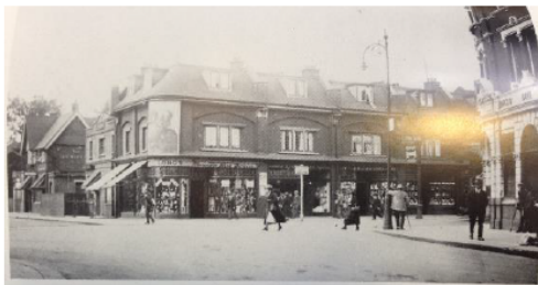
East Street, Barking, c.1934. The junction of Ripple Road and London Road, had recently been converted into a pedestrian precinct with the opening of Village Field Shopping Centre. Bucky's Bank and the Brewery Tap still occupy the same sites. 49